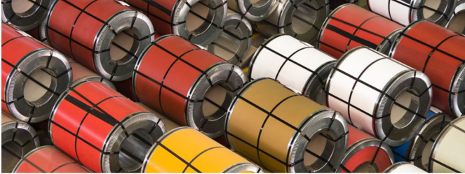
Packed pre-painted coils