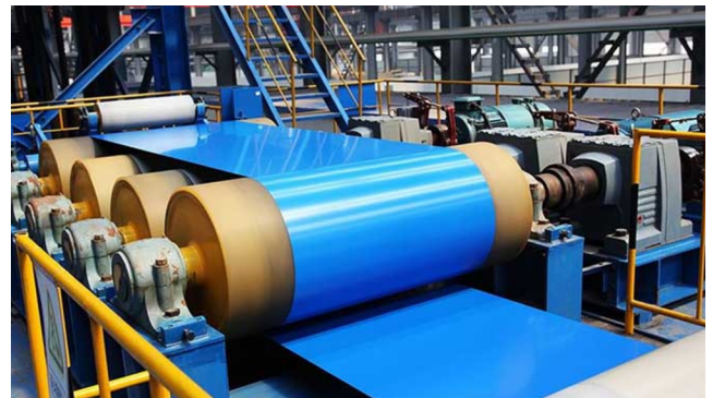
Coil pre-painting process